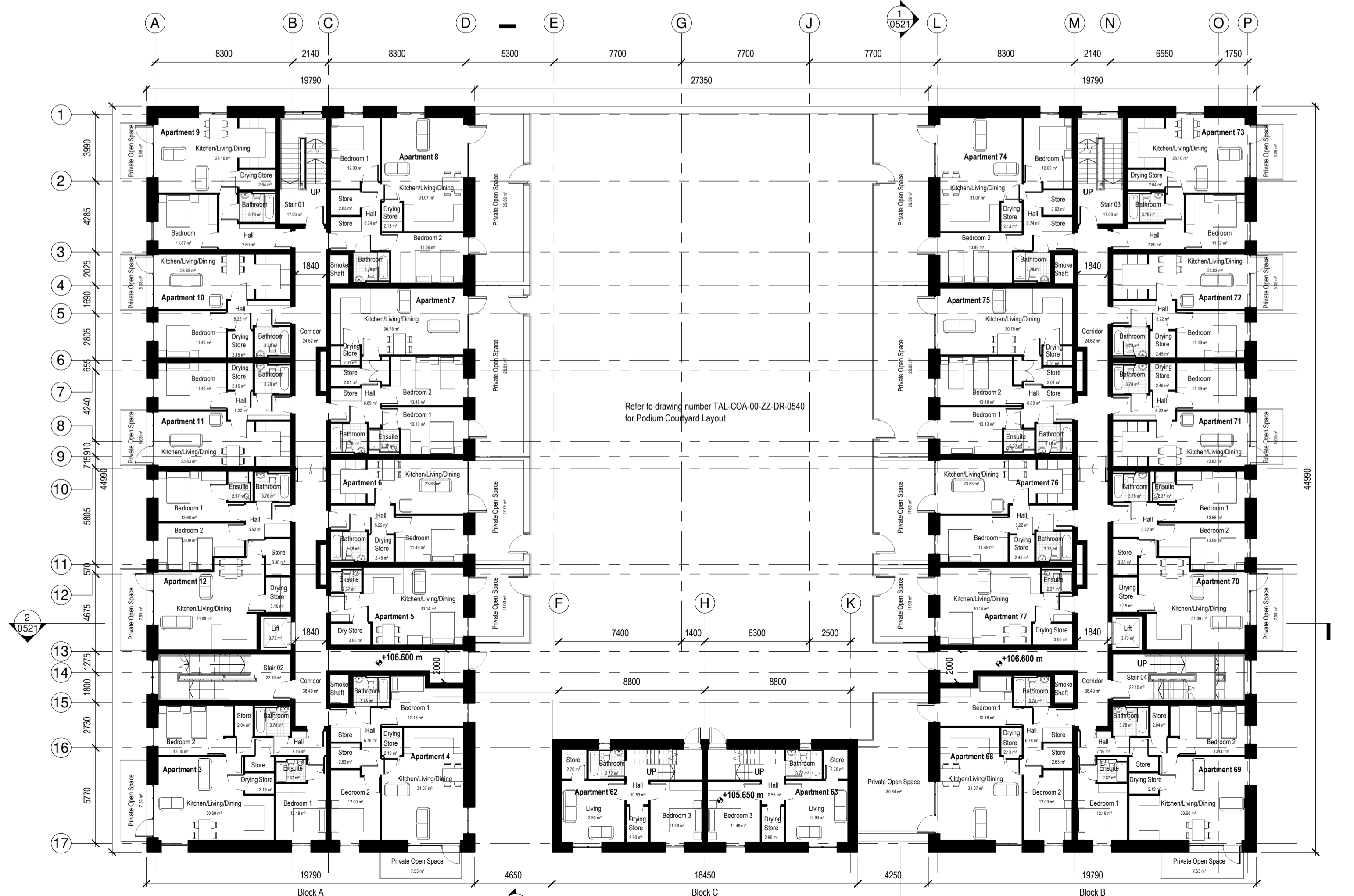
2 Planning-01-First-Floor-Plan T: 200

Notes: Do not scale from this drawing. Use figured dimensions only. All errors and omissions to be reported to the Architect. This drawing to be read in conjunction with relevant consultant's drawings. All dimensions are in millimetres and all levels are in meters to match Datum unless otherwise noted. Contractor Design Responsibility It is noted that there are many elements within the works that require contractor design, and will be subject to certification as part of BCAR - see Preliminary Inspection Plan for clarity on certification required. © This drawing or design may not be reproduced without permission.