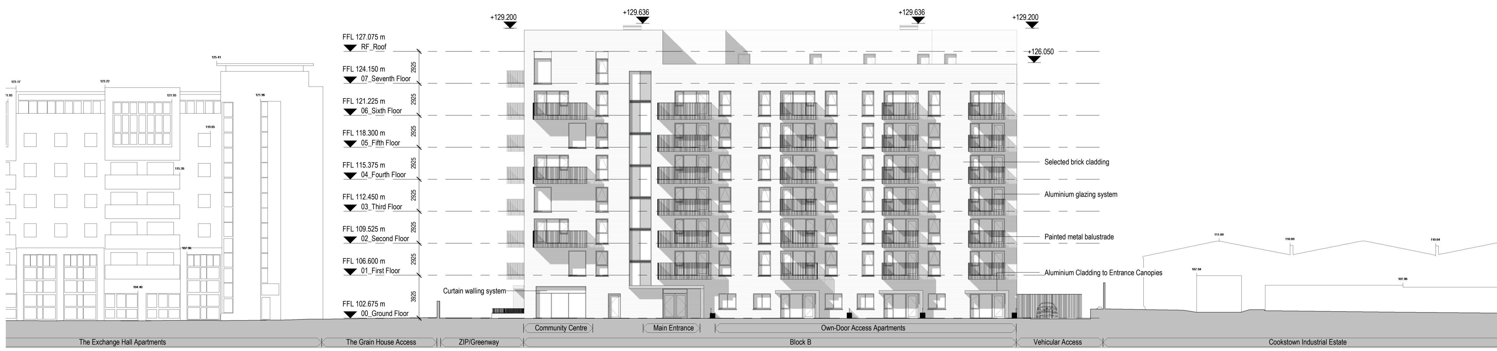
2 Planning - East Elevation 1:200