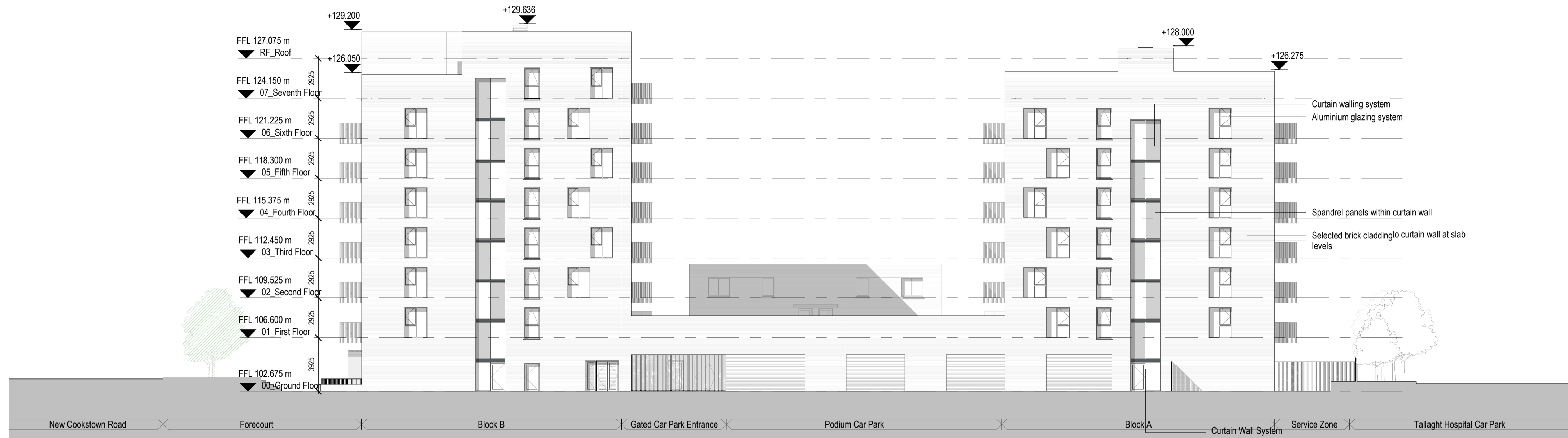
1 Planning - North Elevation 1:200