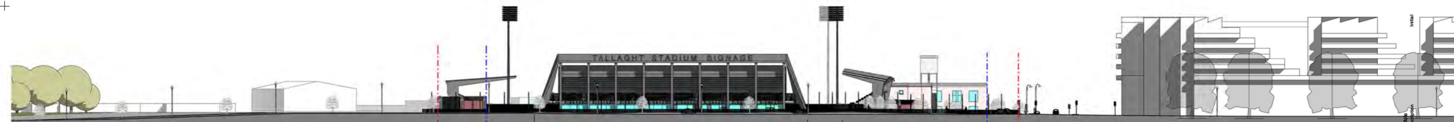
1 N81 Road elevation Proposed 1 : 500

Sean Walsh Memorial park NEW NORTH STAND Blue Line - Denotes extent of AREA subject to Part 8 Application Red Line - Extent of site subject to Part 8 Application WEST STAND Whitestown Way Maldron Hotel Development