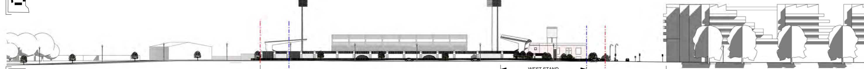
2 N81 Road elevation Existing 1 : 500

Sean Walsh Memorial park NEW NORTH STAND Blue Line - Denotes extent of AREA subject to Part 8 Application Red Line - Extent of site subject to Part 8 Application WEST STAND Whitestown Way Maldron Hotel Development