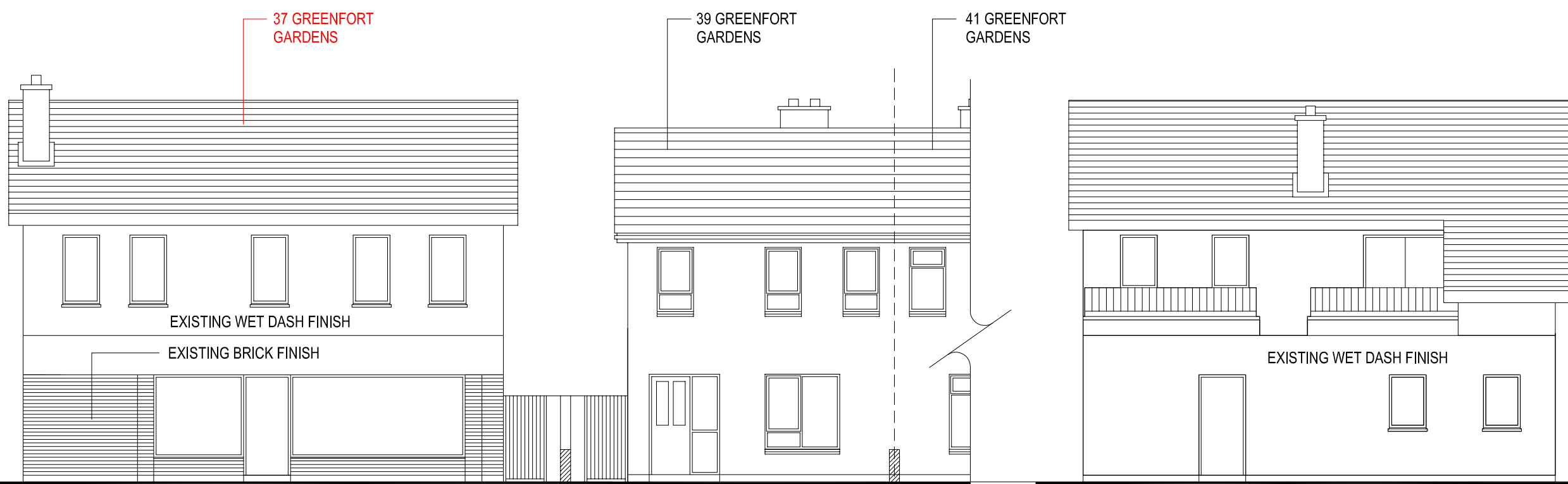
SOUTH / CONTIGUOUS ELEVATION