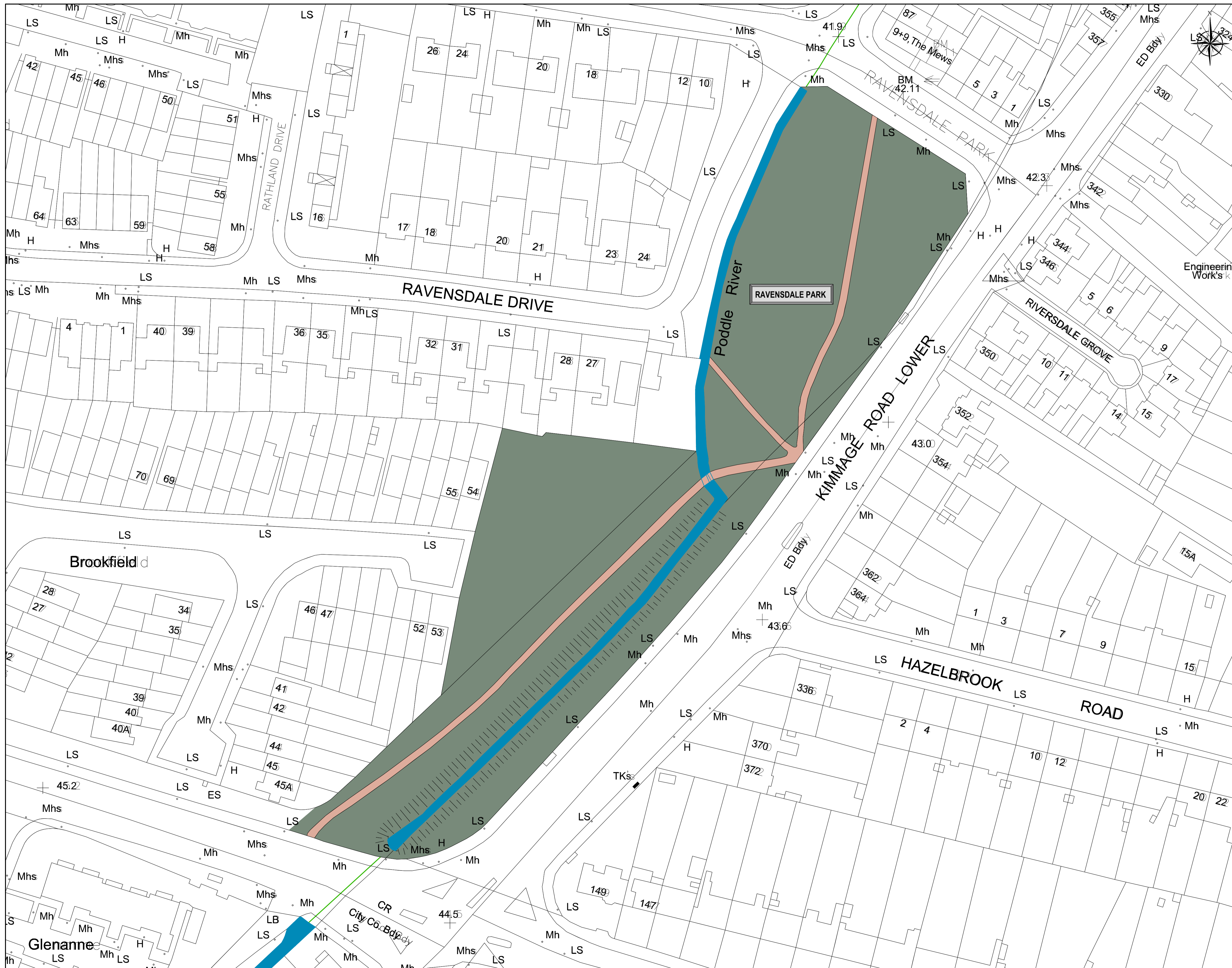
1 Existing Site Plan 1:500