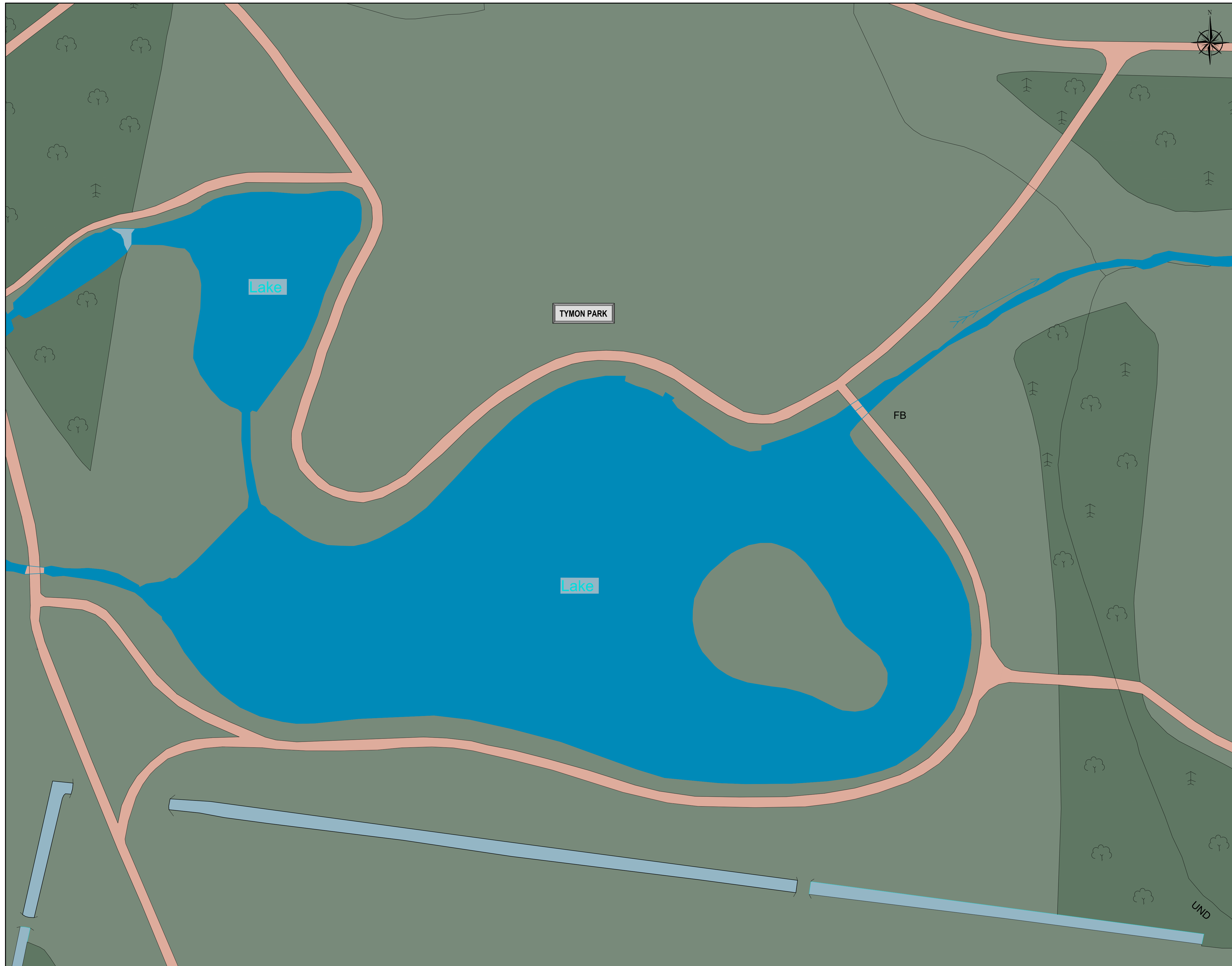
1 Existing Site Plan 1:500