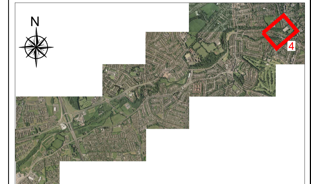
PROPOSED BRIDGE LOCATIONS SCALE: NTS