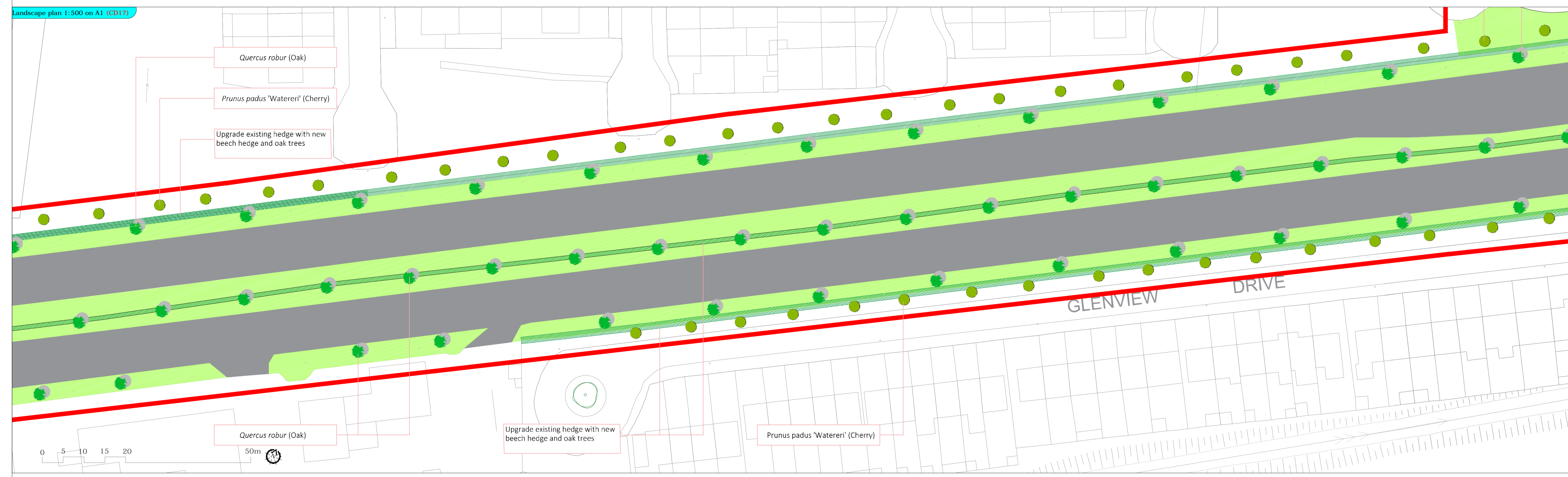
Landscape plan 1:500 on A1 (CD17)

Speed limits for this section of roadway are under review by the South Dublin County Council