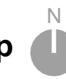
1 Overall Site Location Map 1 : 20000