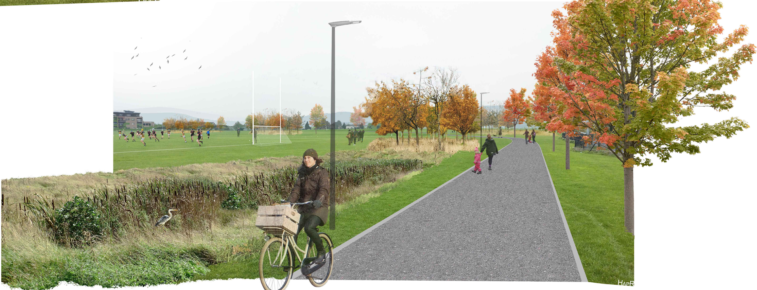
Illustrative View B