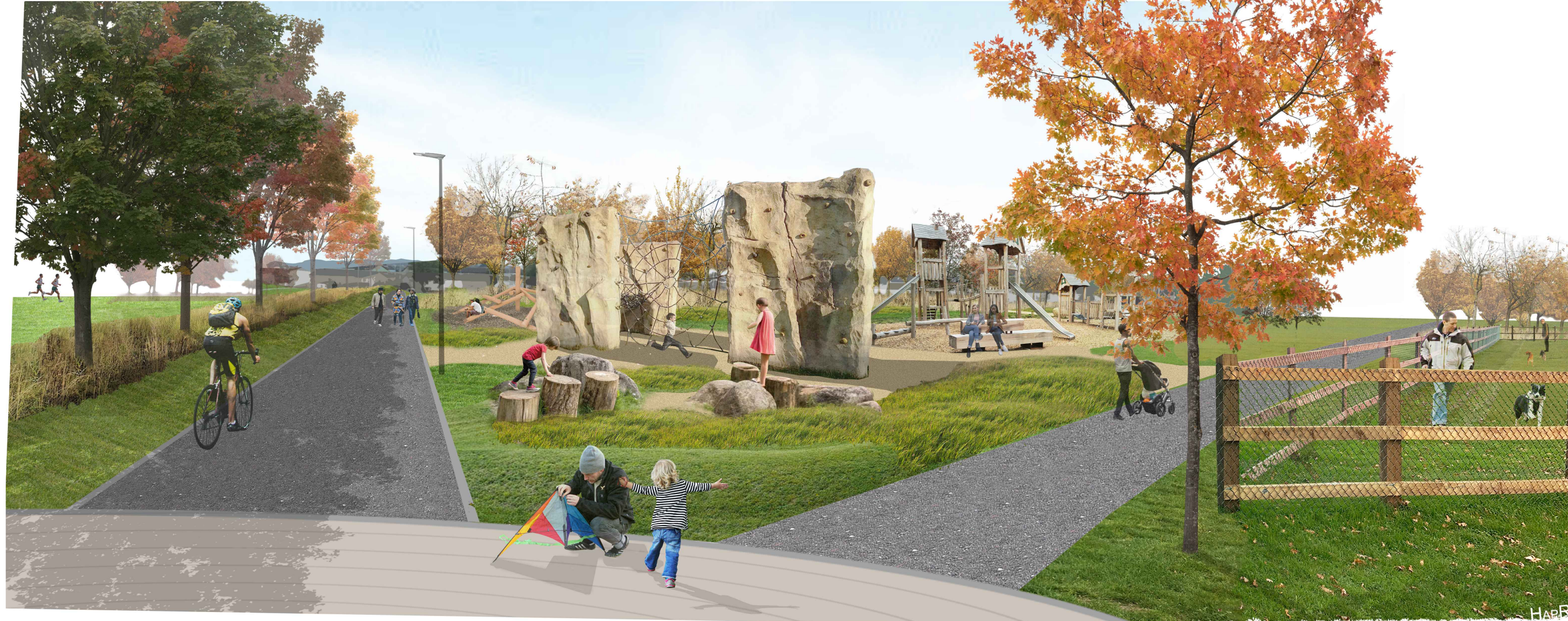
Illustrative View C