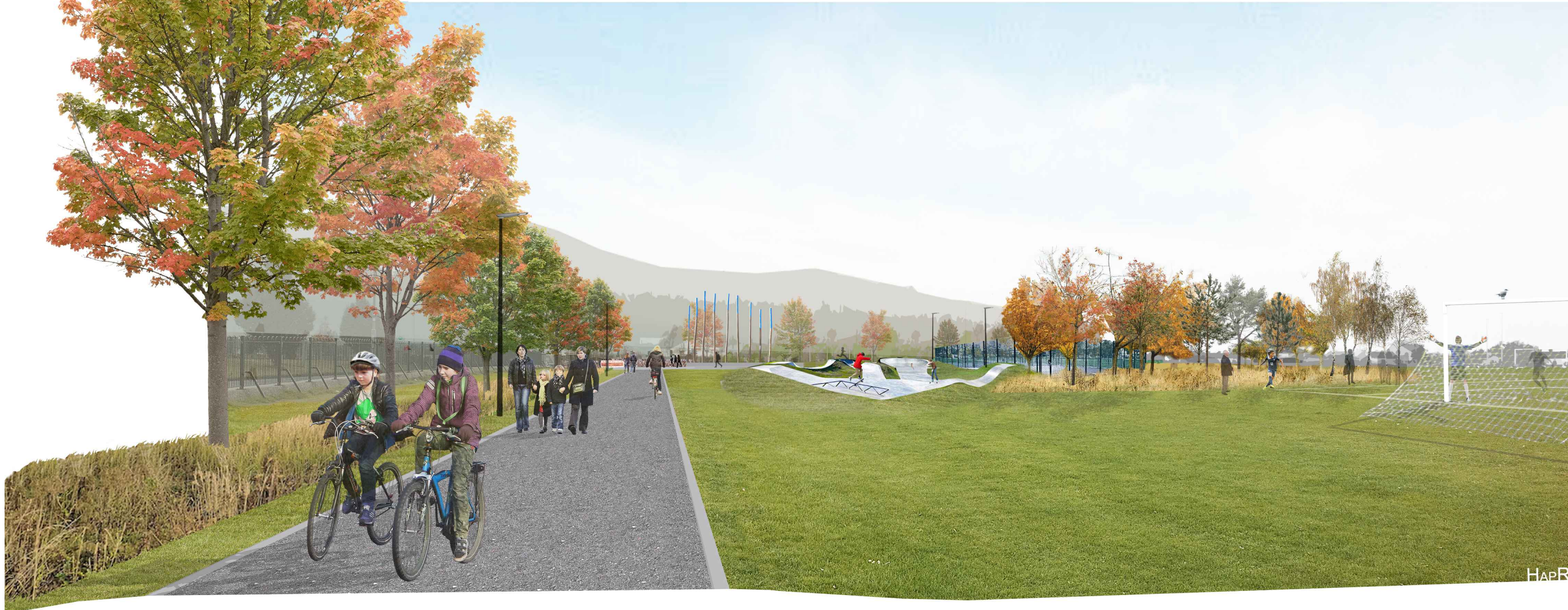
Illustrative View A