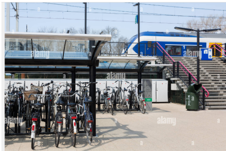
Bicycle parking at the train station in Sassenheim, Holland - with easy access to the train