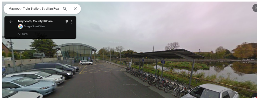
Google 'Street View' of Maynooth train station - with bike parking being well used

surveillance’. Note bike shelters, providing weather cover for bikes, could help to encourage greater use of these facilities. See image below taken from ‘Google street view’ of Maynooth train station showing bike parking in a prominent position