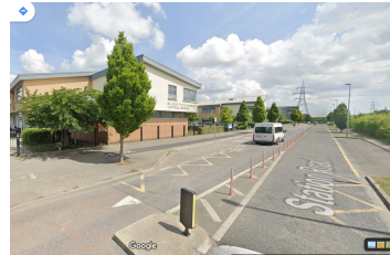
Google 'Streetview' image of schools in Adamstown