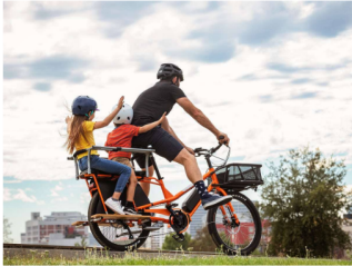
Photo of Longtail bike

In summary, we request that good quality bike parking be provided and it should follow guidance provided in the 'Cycle Design Manual' as well as 'Bike Parking Infrastructure guidance' published by Dublin Cycling Campaign